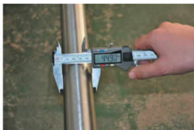
精确到每一微米 Be accurate to every micron