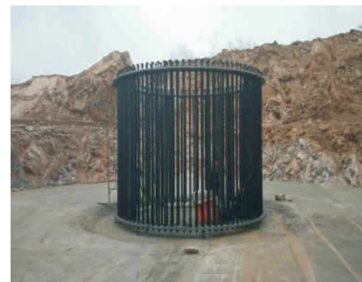
远曲项目 Yuanqu project