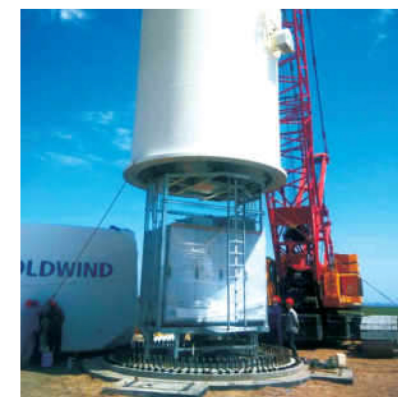
新疆哈密三塘湖200MW风电场项目 XIN JIANG HAMI SAN TANG HU FENG 200MW WIND POWER PROJECT