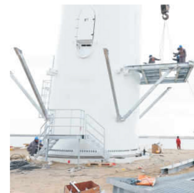
金风6MW机组 Maximum installed capacity 6MW