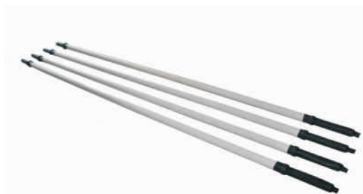
风能锚栓 Wind energy anchor bolt