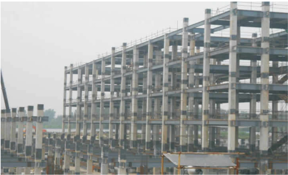
国际箱包城 International bag City